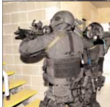
WA Maritime Training Centre – Fremantle